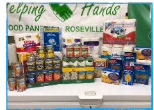
The American Legion Auxiliary

Helping Hands Pantry is honored to be thought of by these organizations during their Christmas sharing events.