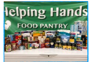
St. Patrick Advent

Each image shows only a portion of the donation brought in by each group!