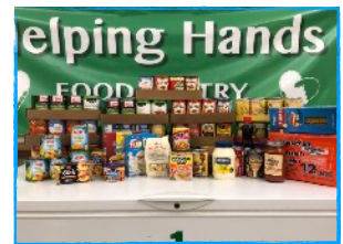
Jr. High Food Drive